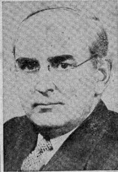
Arthur H. Vandenberg

"Es ésta una política que requiere prontitud en las decisiones relativas a la unificación de Alemania, sitio donde reside el verdadero centro de la recuperación de Europa, y donde el problema debe considerarse en general más bien que como si estuviera dividido en cuatro her-