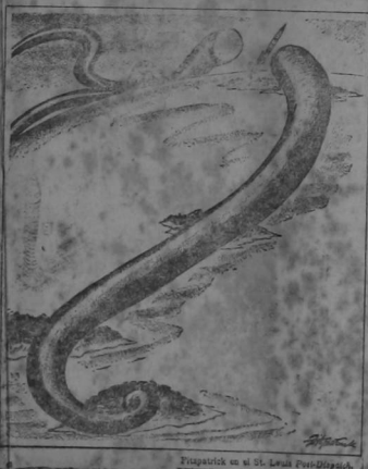
Prospección en el St. Louis Fishery, Inc.