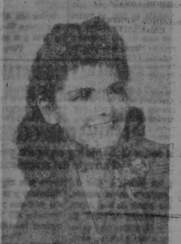
encantadora damita de nuestra sociedad quien se encuentra pasando una temporada en Limón