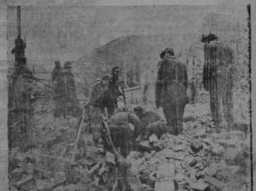
Soldados nazis, tomados prisioneros por fuerzas de los Estados Unidos en el frente occidental, retiran escoltados en las calles de una aldea belga.