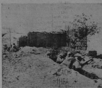
Tropas norteamericanas atrincheradas en la línea de Sigfredo, cerca de Brachelen, prosiguiendo su ataque desde las posiciones recientemente capturadas en la nueva ofensiva contra el Reich.