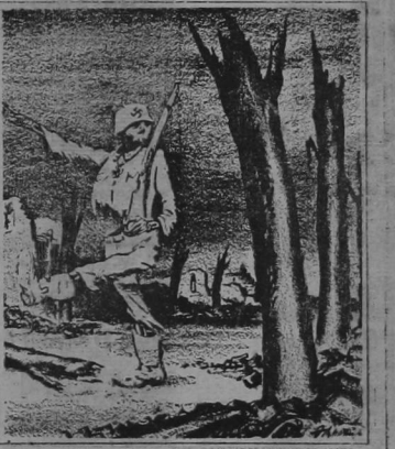
Figura de la 1ª. Línea del Frente.