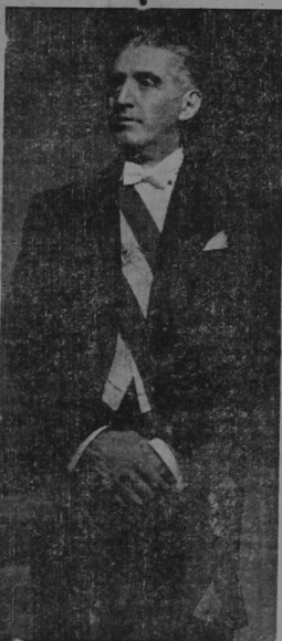
Don JUAN ANTONIO RÍOS

Al medio día del domingo arribó a esta capital su excelencia el señor Presidente de la hermana República de Chile, don Juan Antonio Ríos. Desde media hora antes se encontraban en el aeropuerto, para darle la bienvenida al mandatario, chileno, el señor Presidente de la República y todos los señores go-