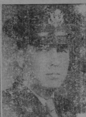
Kenneth C. Royall

WASHINGTON.—Uno de los más notables jurisperitos en asuntos militares de los Estados Unidos, el General de Brigada Kenneth C. Royall, acaba de ser designado Subsecretario de la Guerra por el Presidente Truman.