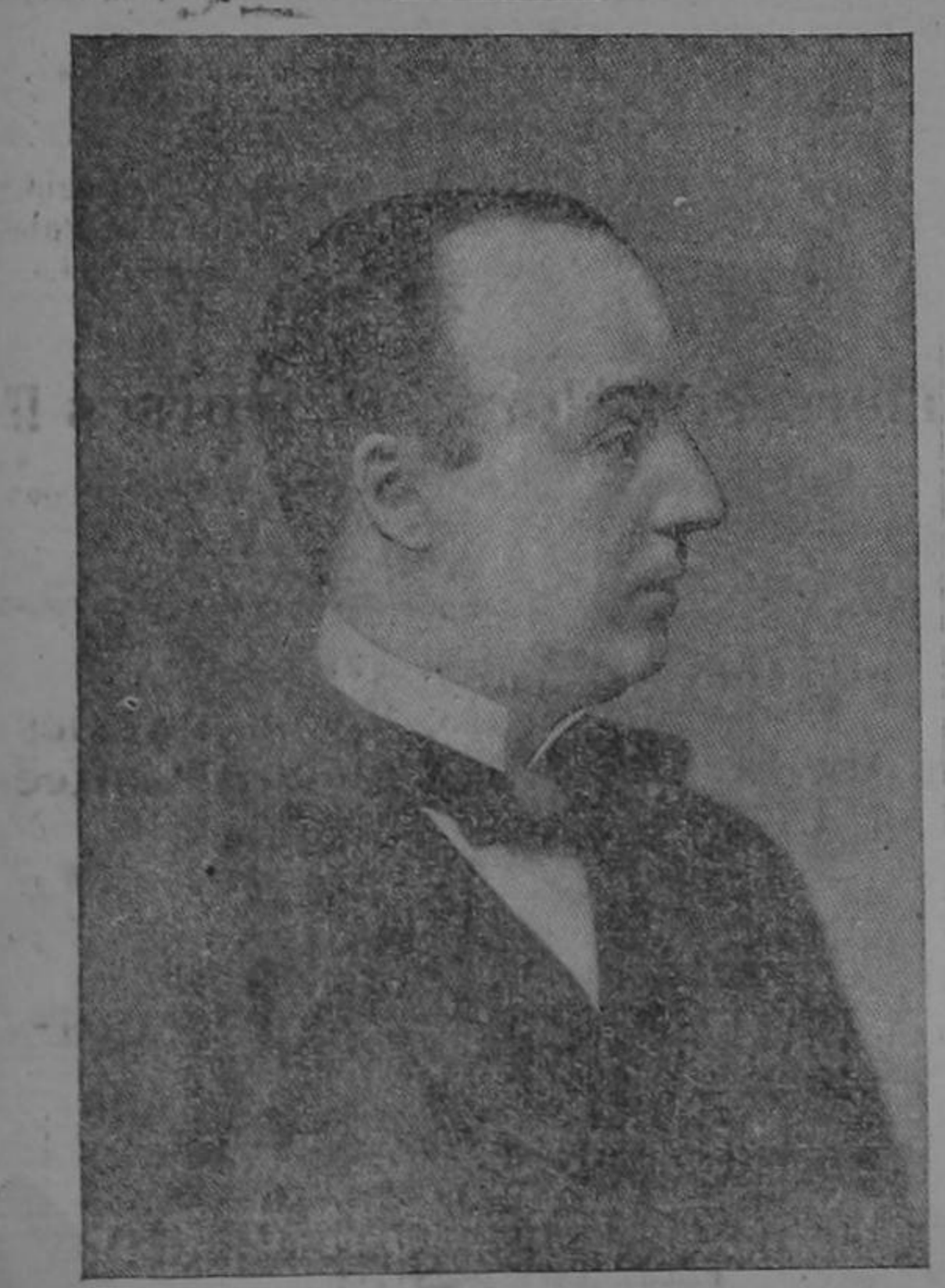
PHILANDER C. KNOX.

Attorney-General of the United States, whose vigorous prosecution of the Northern Securities case has won him fame. He has been recently appointed United States Senator from Pennsylvania to succeed the late Senator Quay.