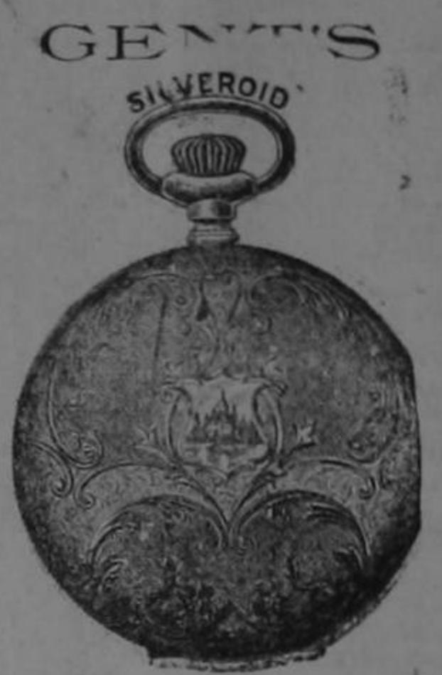
LIVE DOLLARS GOLD