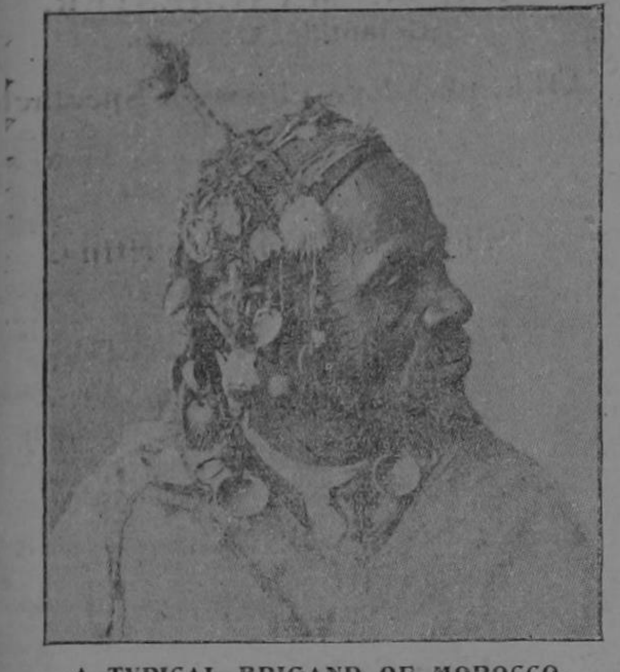
A TYPICAL BRIGAND OF MOROCCO.

Enthusiastic Visitor—If you'll come down into the country with me I'll show you where you can just hear the corn grow! Unemotional Cityite—Humph! If you'll come with me over to the board of trade I'll show you where you can see it grow.—Chicago Tribune.