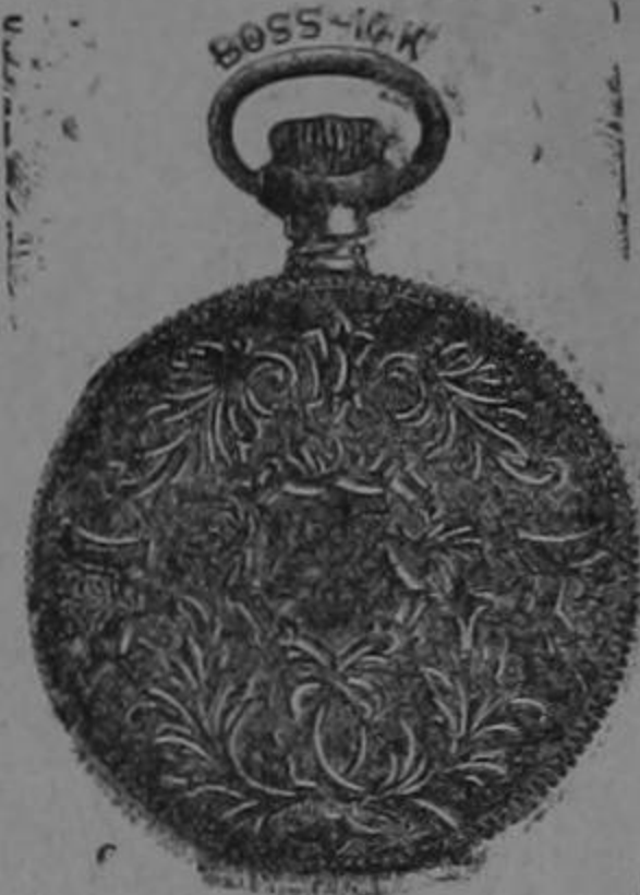
FIFTEEN DOLLARS GOLD