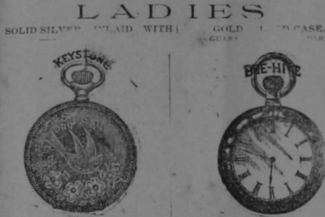
TWELVE DOLLARS GOLD $12 SEVEN DOLLARS GOLD