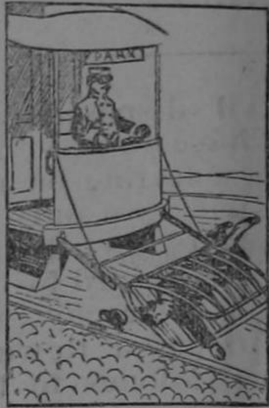
THE TRAP FENDER.

The great difficulty experienced with many of the safety car fenders is that they do not do what they are supposed to do.