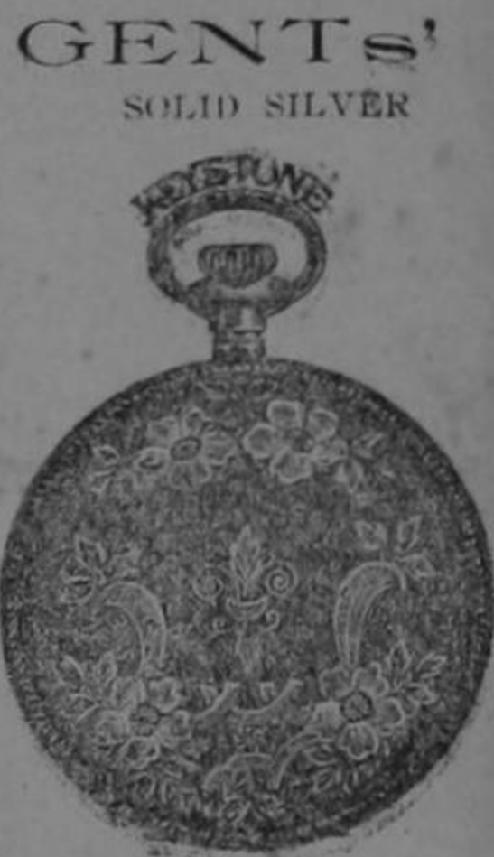
TWELVE DOLLARS GOLD

Keystone-Elgin Watches, direct from the Factory.